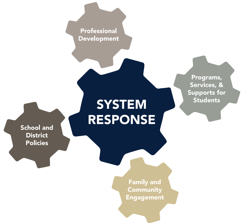
Figure 1: System Response to Trauma

Viewing trauma as a system issue requiring a system response helps to position schools to act collectively and contribute to the betterment of the whole school community. School systems are shaped by interacting policies and practices, including school and district policies, programming for students, family and community engagement, and professional development for school personnel, that together can shape student experience (Figure 1).