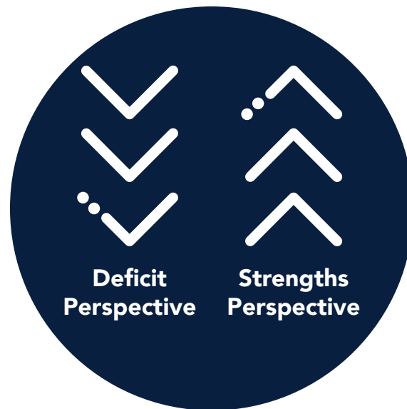
Figure 2. Deficit-Oriented Versus Strengths-Based Approaches Khasnabis and Goldin (2020):

Khasnabis and Goldin (2020) call on school professionals to remain mindful of the ways in which their language and behavior can reinforce the deficit model. They contend that students are far better served by a model based in strengths and assets, which aligns with content in TIPP 7 regarding the importance of high expectations. Focusing on students' existing abilities—and, in turn, how they can use those abilities to facilitate their achievement—assists students in building confidence, feeling motivated, and thinking of school as a positive environment (Figure 2).